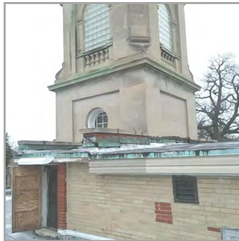
The latest fundraising campaign by Friends of BNC will address repairing several

and limestone blocks damaged by spalling. Both companies are highly rated preservation contractors and noted for their expert work on historic structures.