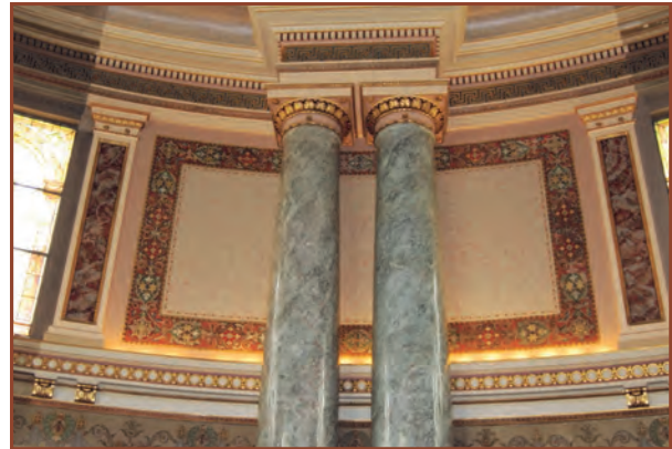
completed Phase One section