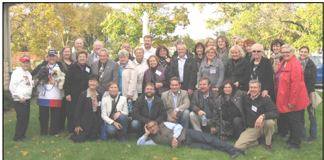
A delegation of officials and educators from Prague, Czech Republic, enjoy a visit to Bohemian National Cemetery, accompanied by representatives from Friends of BNC, and CSAGSI.