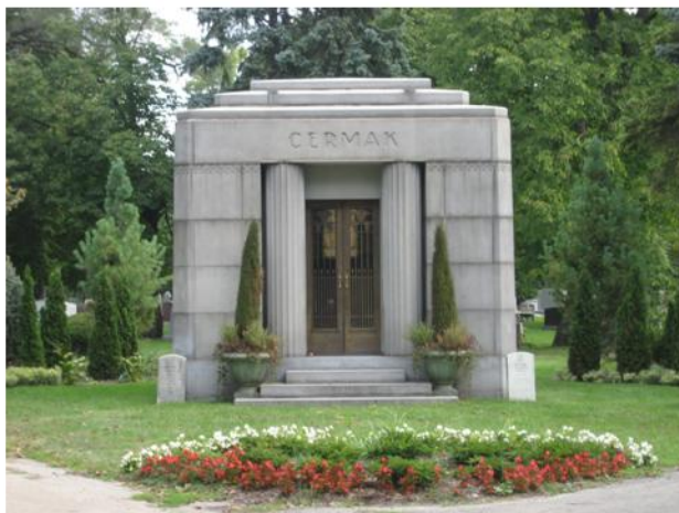
Cermak Family Mausoleum, Section 21

Well, I have to go now. Partnersinpreservation.com is calling me to