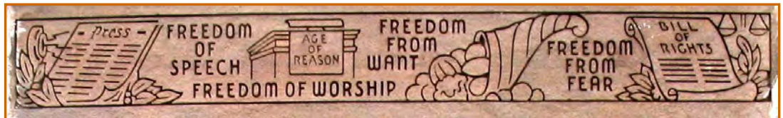
Engravings along the top of each panel of the World Wars memorial depict President Franklin Delano Roosevelt's "Four Freedoms" from his 1941 State of the Union address.