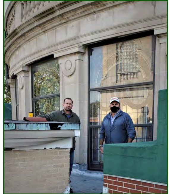
Knickerbocker employees assessing materials needed for current roof project

In addition to the installation of this new roof section, Knickerbocker will make repairs to clay tiles on the curved dome roof over Ceremony Hall. Repairs will also be made to the small flat roof at the rear (south) portion of the building.