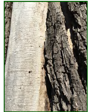
Beetle holes and deep crevices in the bark of this dead cemetery tree can provide food for hungry birds.

To support these birds on this incredible trek, we can make some adjustments