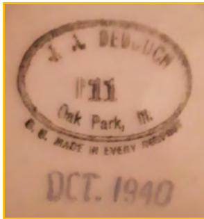
The words on the back beneath the oval appear to read, "U.S. MADE IN EVERY RESPECT"

The back of the Dedo ceramic confirms that it was manufactured by the J.A. Dedouch Company in October 1940; the slightly blurred logo appears to have been applied to the back with a rubber stamp.