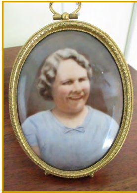
3x4" ceramic Dedo