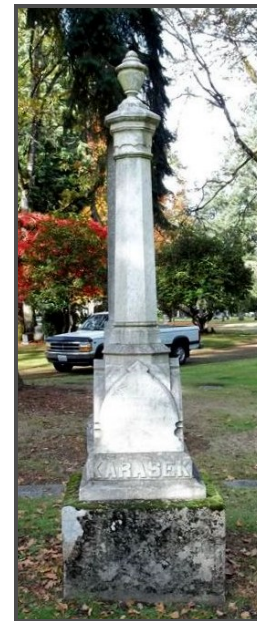
The Karásek family plot at Tacoma Cemetery, Tacoma, Washington.