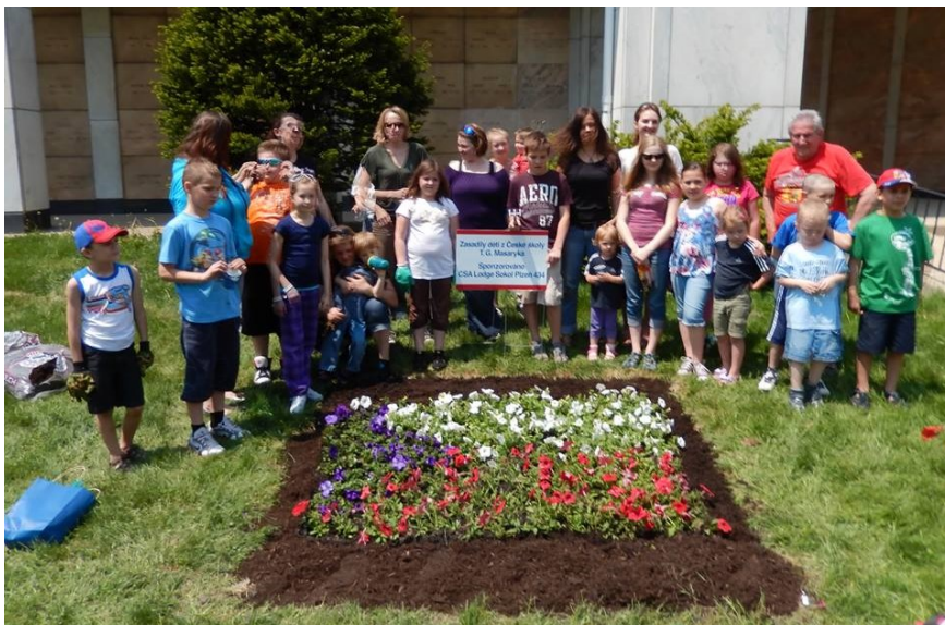
On May 18th, Students, parents and teachers from T. G. Masaryk Czech School planted their contest plot, in the design of the Czech flag, by the Masaryk Memorial Mausoleum.