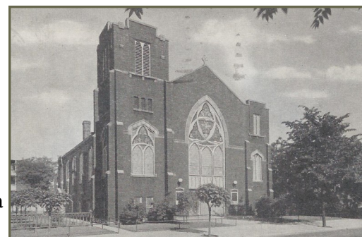
The Hubbard Memorial Church at 2520 S. Lawndale in Little Village is today home to the Lawndale Mennonite Church.